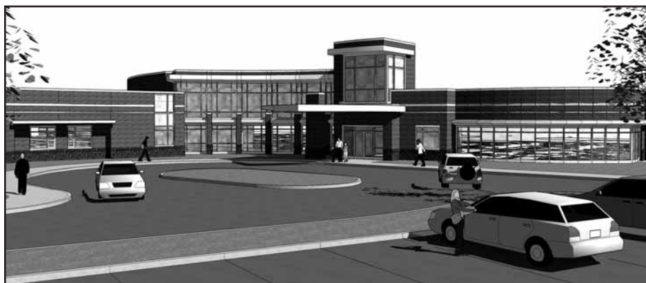
An artist's rendition of what Chatham Hospital will look like.

To recognize major contributors, a number of memorial and honor possibilities, including rooms and sections of the new hospital have been identified and can be dedicated in honor of a family member, civic group or business. Prominently displayed plaques will identify the honorees. A donor wall will be placed in the lobby to recognize all donors contributing over $1,000.