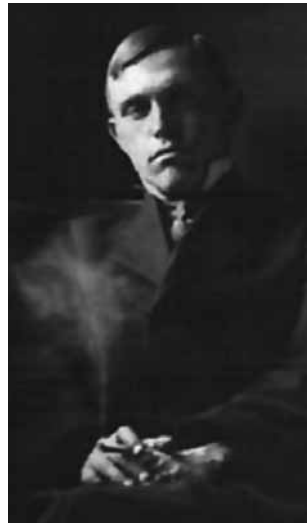
Damon Runyon's New York stories come to life in Northwood High School's production of Guys & Dolls from March 25 to 27.

Join the debonair gamblers, show-girls, con artists, tourists, and mission dolls of Times Square when Damon Runyon's New York stories come to life again in Northwood High School's production of, Guys & Dolls , March 25-27. The 1950 classic with music and lyrics by Frank Loesser includes some of Broadway's best known numbers—Luck Be A